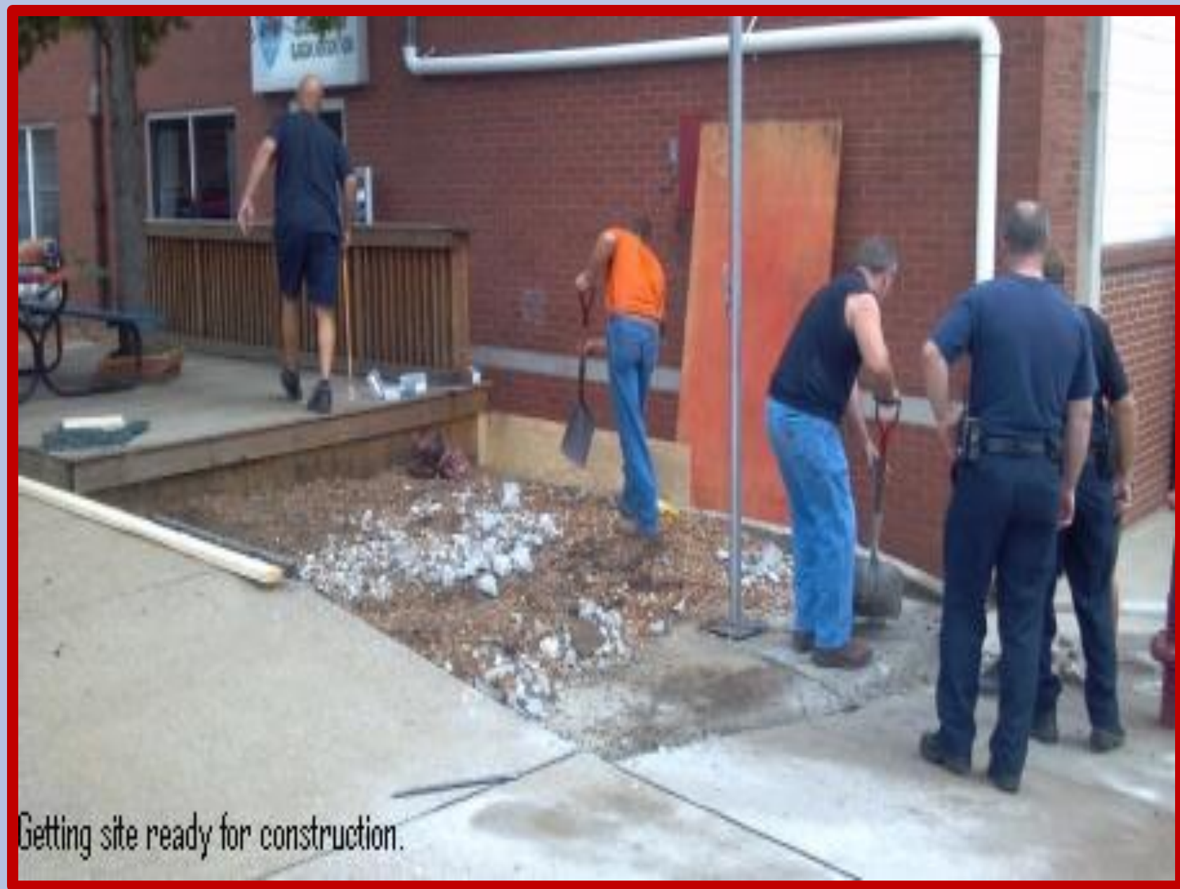
Getting site ready for construction.